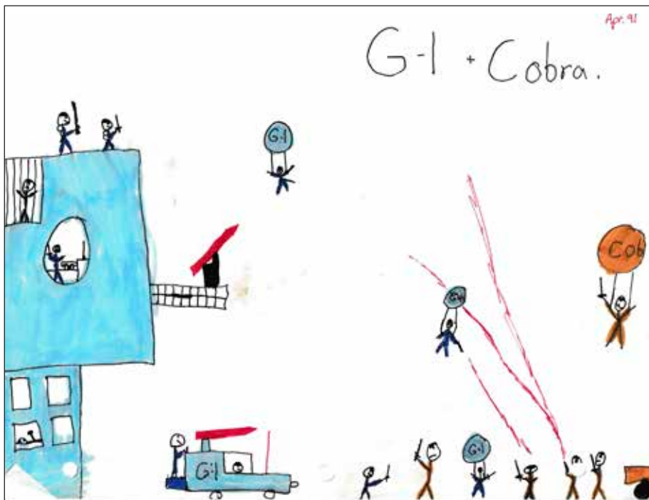
Figure 4. G.I. Joe + Cobra. Drawing by author, April 1991.

I also wonder if the violence I enacted in play was a way of coping with the violence that I witnessed in my life as a TCK. That violence included the beginnings of a political rebellion in the Casamance, which Momar Diop (2003)